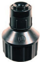
Spectrum™ Thread 1/2"