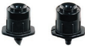
Spectrum™ Barb 4mm