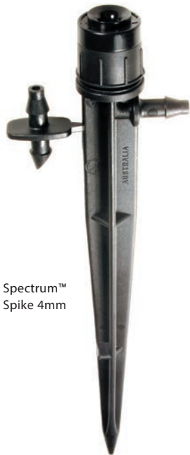
Spectrum™ Spike 4mm